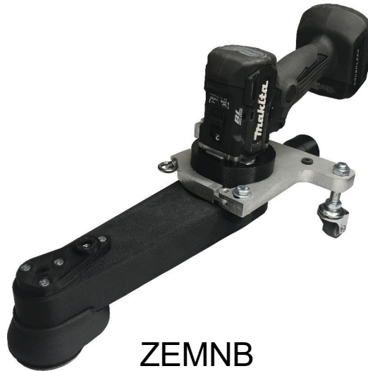
ZEMNB Micro 2" Needle Edger

4131 Highway Route 20 Esperance, NY 12066 (518)-875-6124 sales@ussander.com